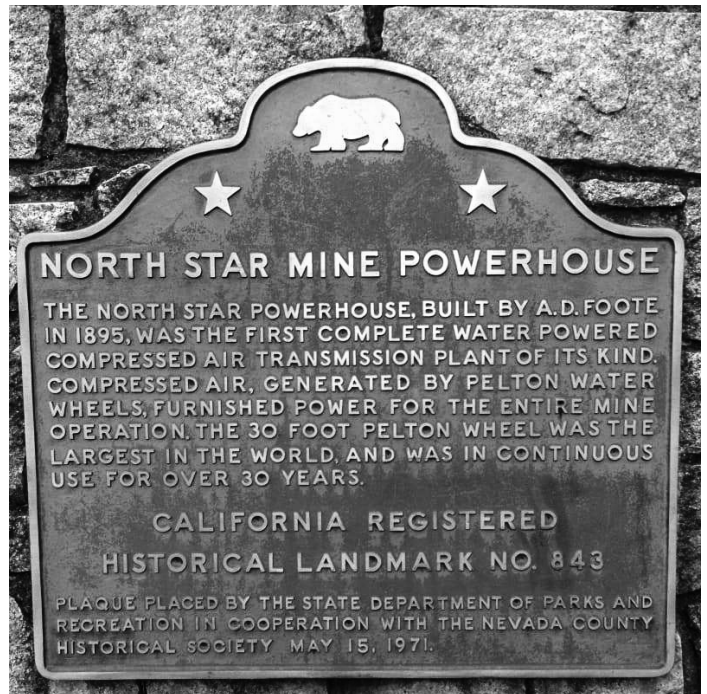
North Star Mine Powerhouse Plaque