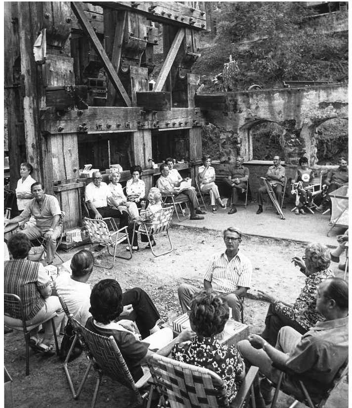
Rotary Club of Grass Valley chicken dinner, August 1973