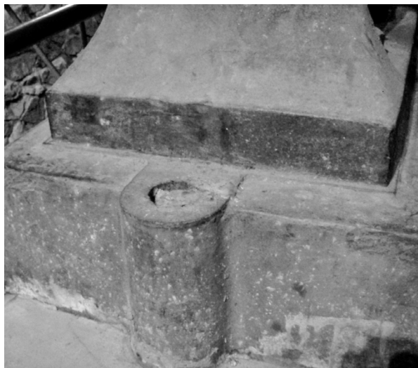
Cut mounting bolt on Pelton wheel base