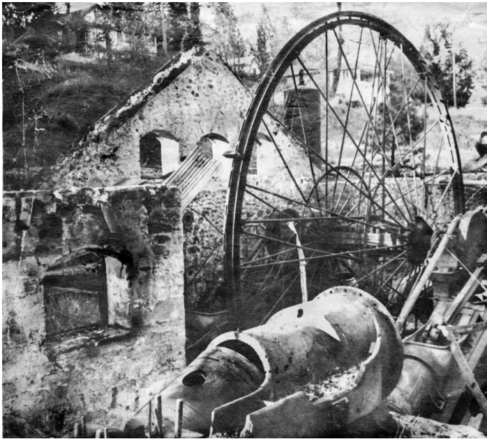
Powerhouse after roof fire, Courtesy Searls Historical Library Collection

on the 30 foot wheel. Phebe made an appeal to please return the buckets that had been unbolted and taken as souvenirs over the years. Possibly some of the buckets were salvaged after the fire. That appeal didn't go too well. 17 The NCHS purchased 55 buckets from the Knight Foundry in Sutter Creek for $1,080 to replace the missing buckets. 18