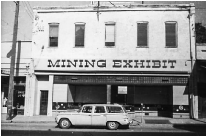
Temporary Museum on Mill Street 1968